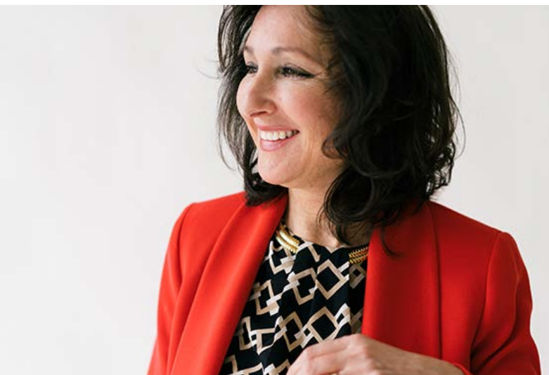
Majda Ficko Olen Skin Care